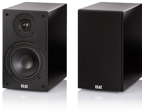
◀ Standard in Line 70 BS 73 with and without a fabric grille