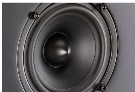
▲ FS 78 midrange driver