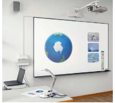
The Epson teaching solution: connect the projector to the ELPCB01 Control and Connection Box for easy access to switches. The tailor-made ELPMB27 Wall Mount reduces installation time