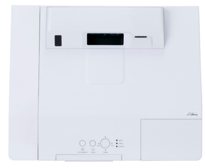
Top View (with cable cover)